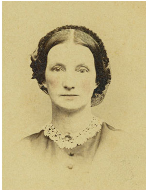
Photo: Ann Preston, MD.